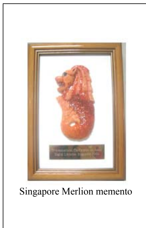
Singapore Merlion memento