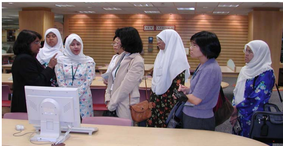
ICADL2002 delegates at the C J Koh Law Library

ICADL2002 also hosted professional tours to the libraries of the National Library Board (NLB), Nanyang Technological University (NTU) and National University of Singapore (NUS) Libraries on Friday, 12 December from 5.00 pm to 7.00pm. The original 35 places for each library tour was quickly filled and additional transport and logistics were arranged to cater to the average of 50 participants for each tour finally. Each participating library hosted a one-and-a-half hour tour of their libraries that included the Woodlands Regional Library (NLB), Lee Wee Nam Library (NTU) and C J Koh Law Library (NUS). In line with the theme of the Conference, the delegates were given a presentation of the respective digital library and its services. This was followed by a tour of library facilities. The visit ended with some light refreshments and informal exchange amongst the delegates and library representatives.